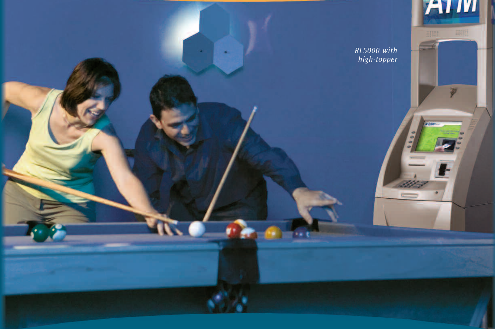
RL5000 with high-topper